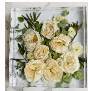
3.75 cm depth 3D flowers