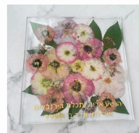
1.25 cm depth flat pressed flowers